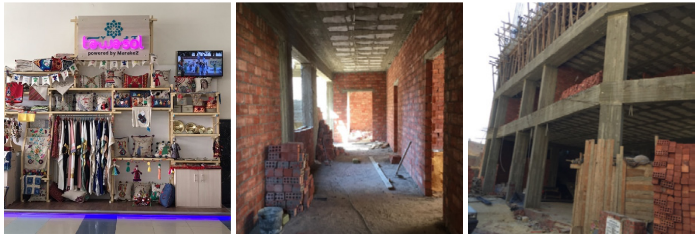
United Nations Global Compact Communication on Progress

SODIC supported the school covering its running cost and contributed to the purchase of a 1,000 Sqm land plot in Ezbet Khairallah to build a new school that will take up to 500 students, the school is well under construction.